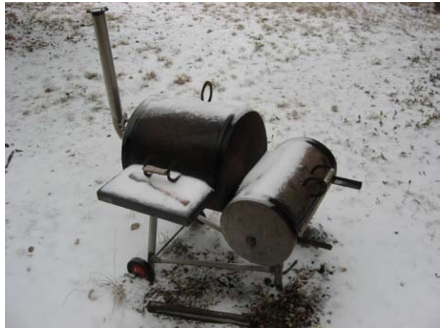
A BBQ grill with snow becomes a novelty for the eyes.