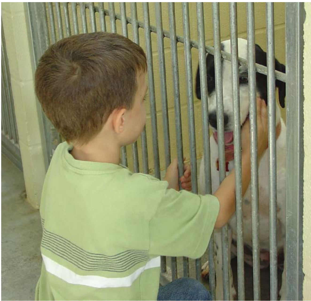
A youngster with "Smiles," one of the larger dogs at the SPCA shelter.