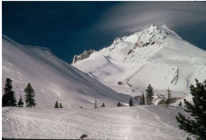
A view of the beautiful but deadly summit of Mt. Hood in winter.