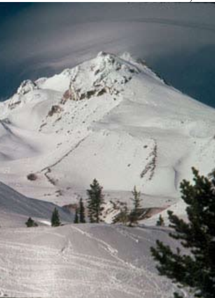
A view of the beautiful but deadly summit of Mt. Hood in winter.

For him, watching the drama unfold on television made him more aware that death and destruction are so close, and that we are so fragile. While he was sawing lumber, he thought how easily the saw was cutting the boards, and yet how much softer, and more vulnerable to the blade he was than those boards. Death is so close to us,