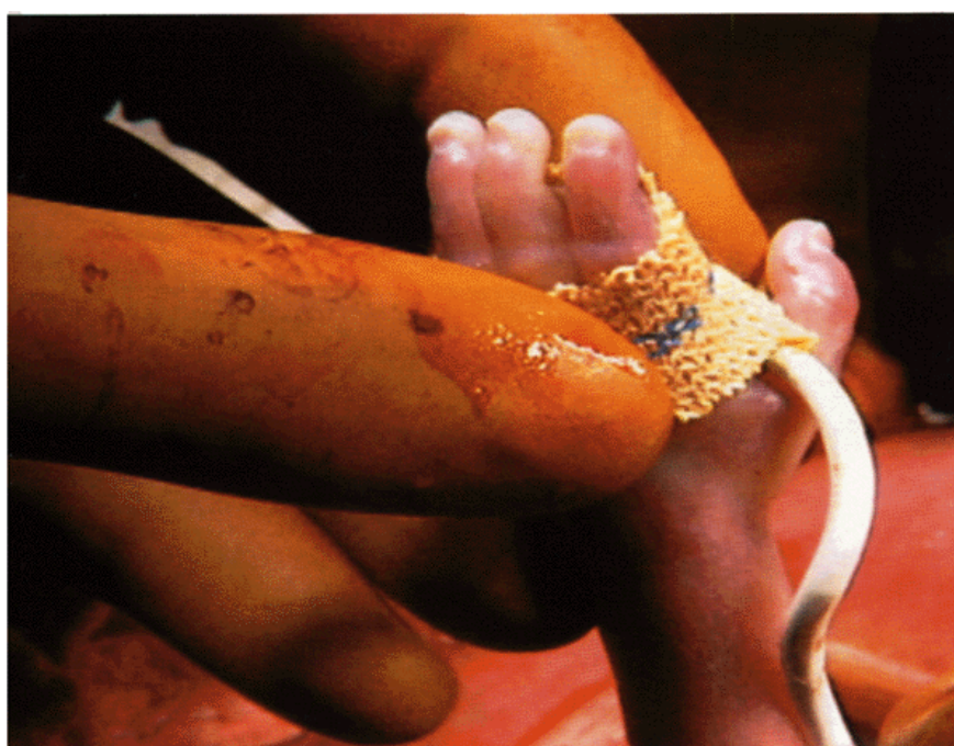
Holding the hand of an unborn baby during surgery. "choose life" Deuteronomy 30:19

So God created man in his own image, in the image of God created he him; male and female created he them. Genesis 1:27