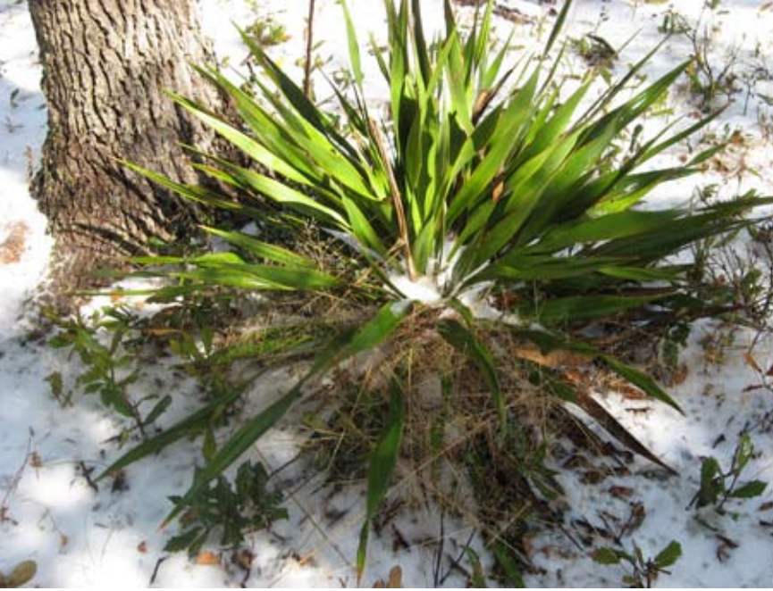
Brilliant green with a snowy white background.

But Jesus said, Suffer little children, and forbid them not, to come unto me: for of such is the kingdom of heaven. Matthew 19:14