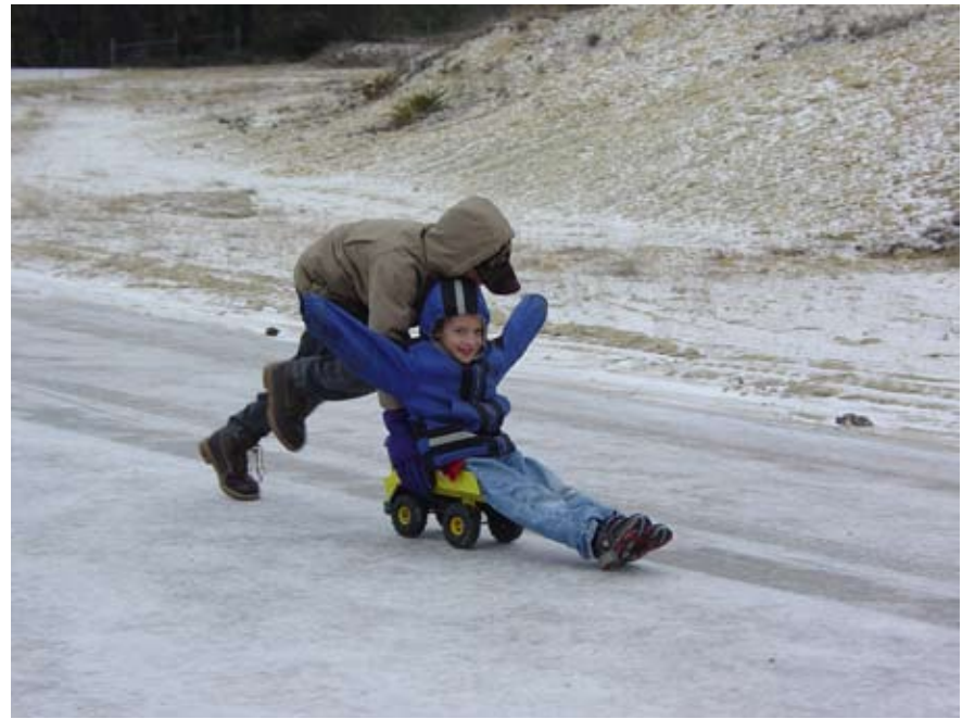
These youngsters are putting the ice on the road to good use.