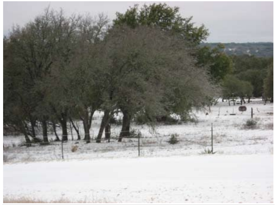
Snowy scenery.