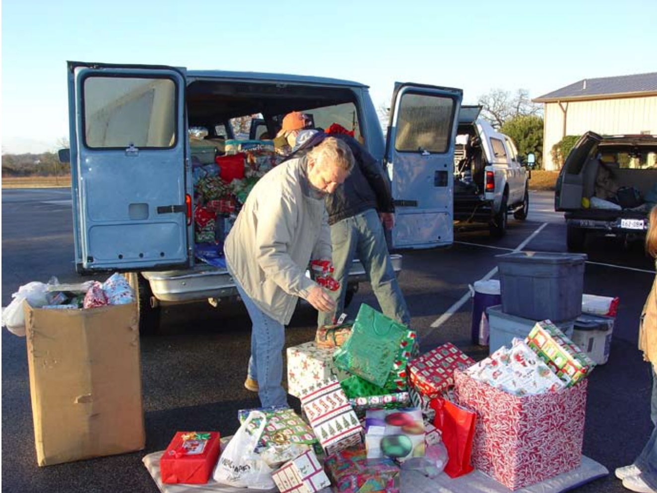
Preparing to head out to Mexico, gifts for the children are being loaded into one of the vehicles that will make the long and very rough trip.